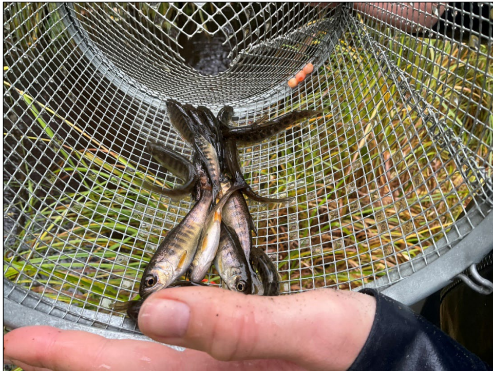
Figure 1.—Juvenile coho salmon captured at waypoint 1245.