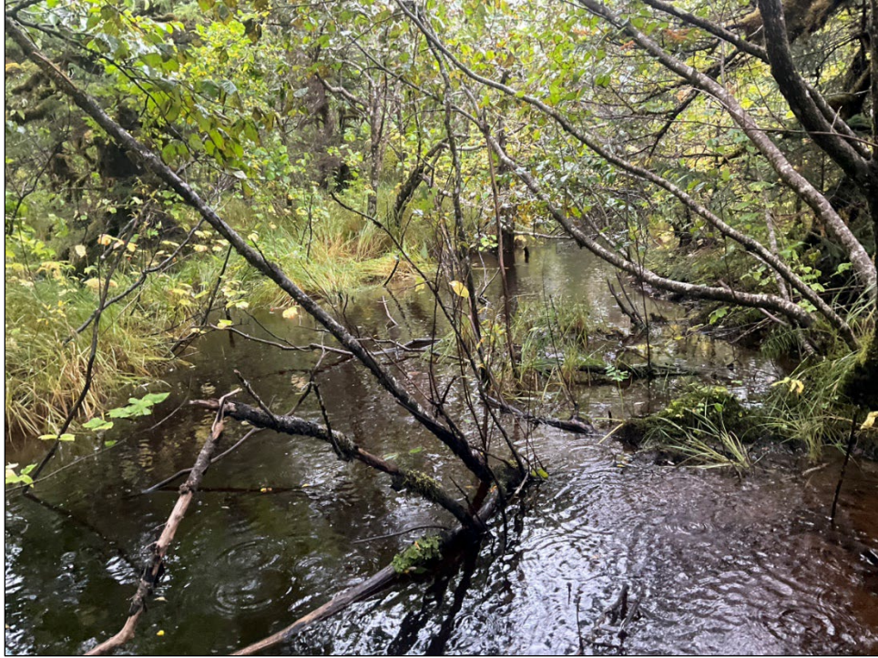
Figure 2.—Stream channel at waypoint 1245.