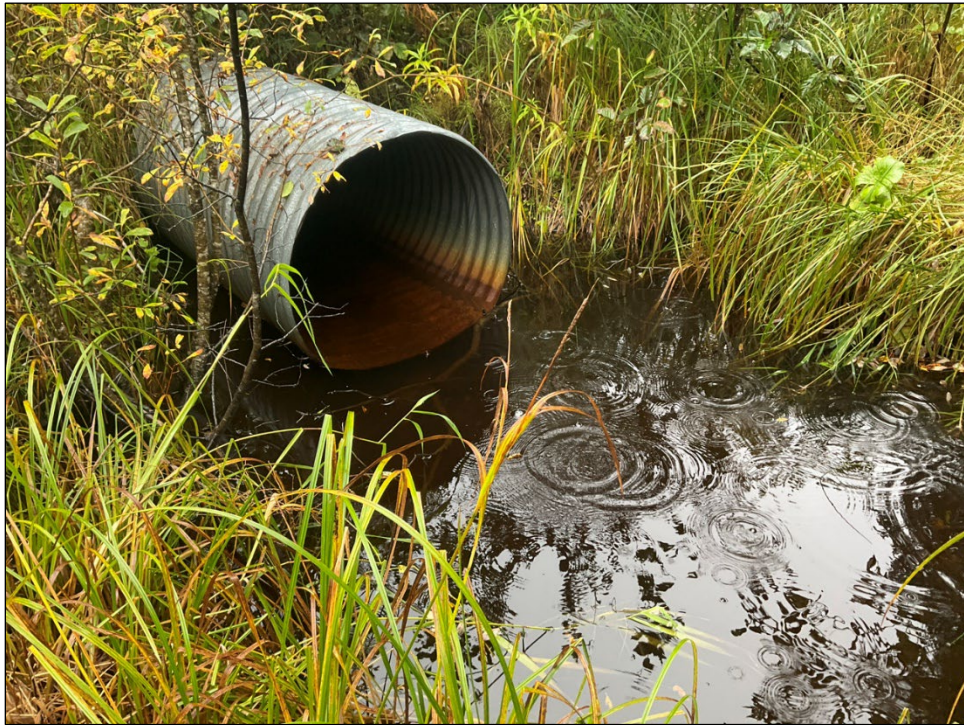
Figure 3.—Culvert at waypoint 1245